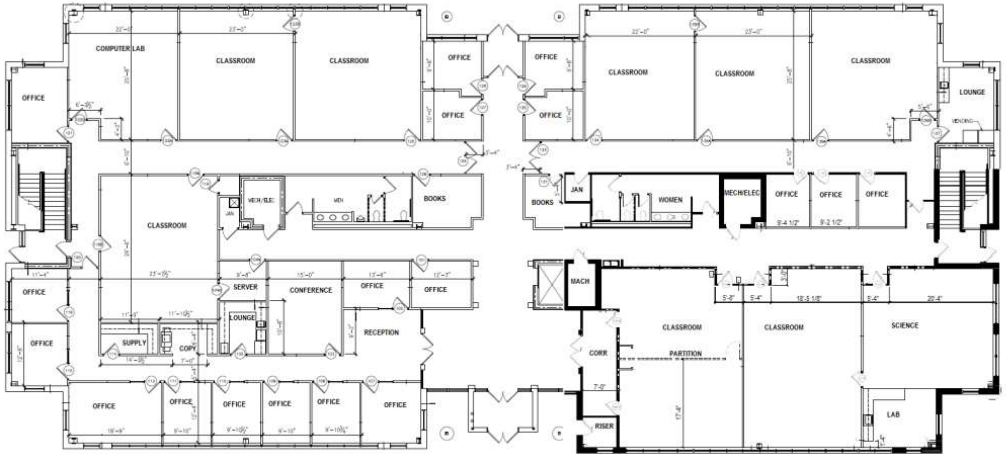
1838 SIR TYLER - FIRST FLOOR 15,112 RENTABLE SQUARE FEET